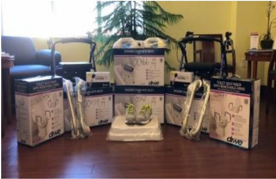
Profits from an in-house fundraiser funded this purchase that cleared out Equipment Exchange waitlist.